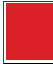
Full page 243mm wide x 326 mm high